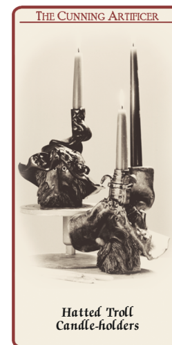
Hatted Troll Candle-holders