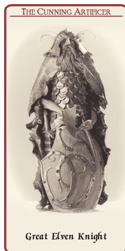
Great Elven Knight