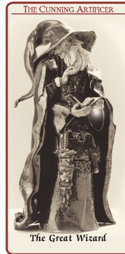
The Great Wizard