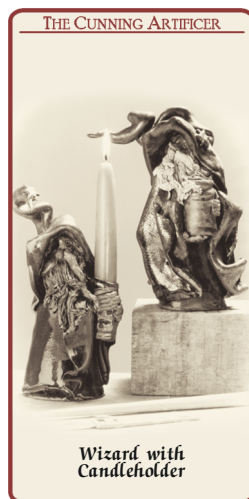
Wizard with Candleholder