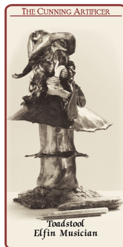
Toadstool Elfin Musician