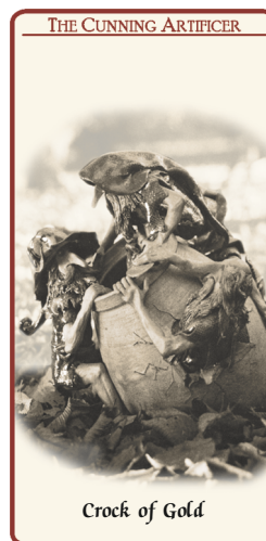
Crock of Gold