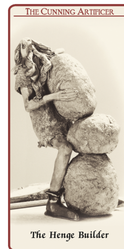
The Henge Builder